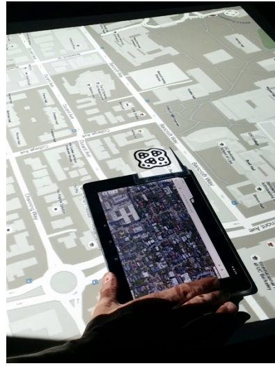
Figure 3. Examples of applications developed with the ROSS Toolkit: canvas mirroring (top) and peephole display (bottom).

space to support human activities. State of the art and open issues.