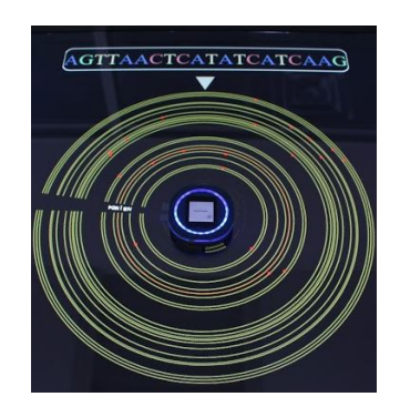
Figure 5: An Actible being used on table to view DNA sequence mutation data in the mtDNA application

Figure 4: Two Actibles in an off-table interaction in the Active Pathways application. Each Actible is bound to a molecule and touching them together creates a reaction between the two molecules.