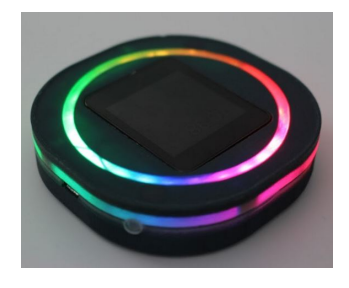
Figure 1: Actibles are a smartwatch-based active tangibles platform that incorporates additional sensors to detect stacking and neighboring, as well as LED feedback. The image shows an assembled Actible.